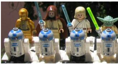
Kid chess @ the Library

ings from 9:00 -10:15am and is targeted for learning and practicing the basic yoga postures, stretching the body, and activating breath work techniques. Finally, the Vinyasa Flow class meets on Tuesdays and Fridays from 9:00-10:15 am and is an active sequencing of postures for those familiar to yoga. For more information, go to