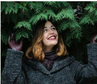
Trees available Nov. 25 @ La Tienda

Starting the day after Thanksgiving, Eldorado radio listeners will now be able to enjoy a variety of holiday music without commercial interruption. ELDORADIO 1660 AM , low-power "neighborhood radio," introduces a touch of seasonal music beginning annually on "Black Friday," —a traditional opening of year-end festivities. Each day, the local station adds a little more Christmas and Hanukkah favorites, classical tributes to the season and carols from around the world. For more information check out eldoradosf.org