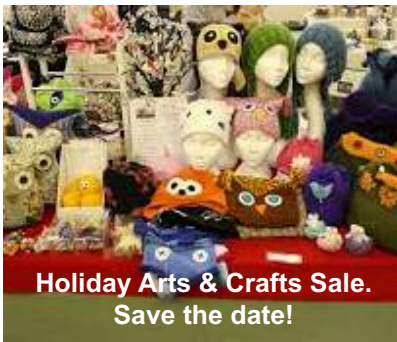
Holiday Arts & Crafts Sale. Save the date!