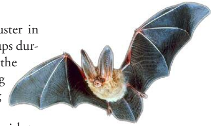
Big-eared Townsend fleder-maus.

Choose to get informed and choose to help today. —The Eldorado Neighborhood Watch Program