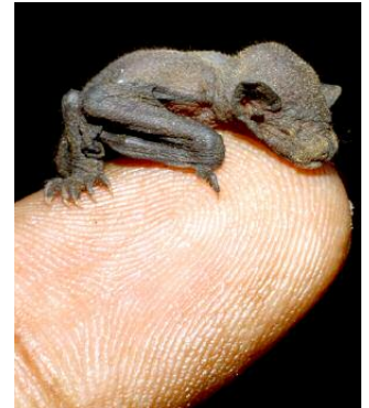
Newborn lesser short-nosed fruit bat.