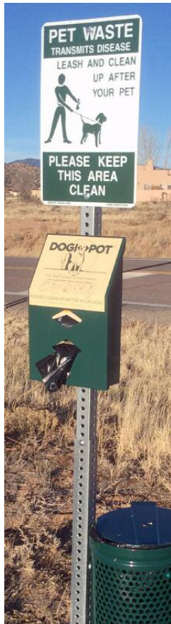
Dogi-Pot station on hike/bike trail (see story on p. 2).

The next regular meeting of the ECIA Board will be held on March 16, 2017, at 7 PM in the Railroad Building at the ECIA Community Center. Complete minutes and agendas of all ECIA Board meetings are available at the ECIA office or on the website www.eldoradosf.org .