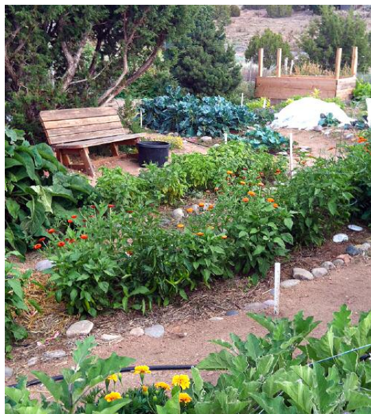
Eldorado's Community Garden