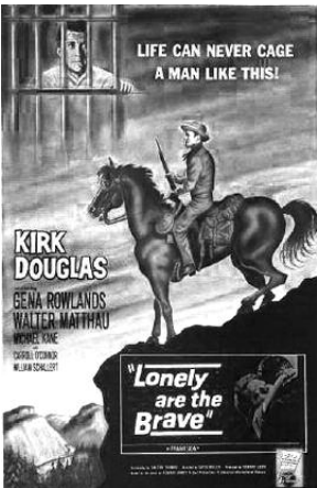
Lonely Are the Brave screening January 21, rescheduled from October. For schedule updates, check reelnewmexico.com .

Released in 1962, Lonely are the Brave still seems totally modern—probably because it deals with issues that continue to matter: individual freedom vs. authoritarian clampdowns and an increasingly militarized and regimented America. Abbey loved the desert and hated unnecessary machines. Director David Miller communicates this, contrasting magnificent, monochrome, cinematic images of landscape and wildlife with the screeching, rattling grinding of trucks and cars. The